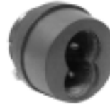
No. 316 Tapered Mortise Cylinder