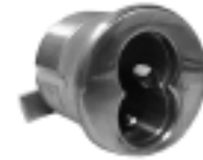
No. 306, 307 Mortise Cylinder