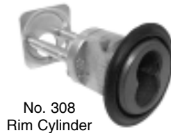
No. 308 Rim Cylinder

* sold less cam, with cam screws & retainer